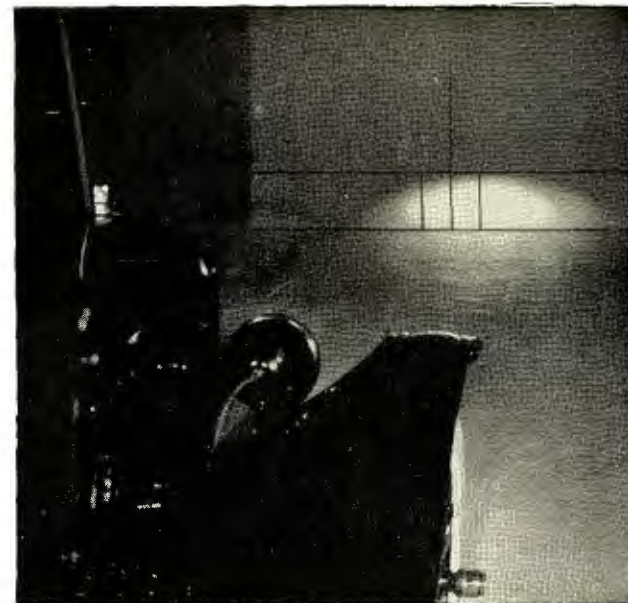
Right Headlamp Properly Focused and Aligned.