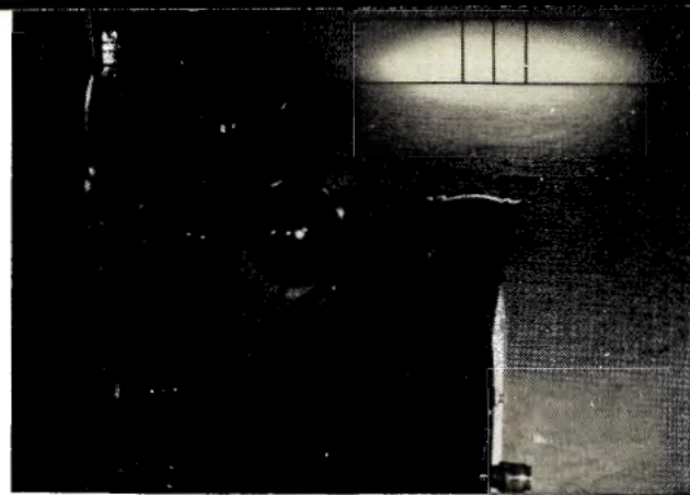
Both Headlamps Properly Focused and Aligned.

Proper alignment is readily checked by means of a horizontal line on the wall in front of the car 28 inches above the level surface of car, and two vertical lines 28 inches apart, each one 14 inches from center line of car. Proper alignment of car relative to marks on the wall may be readily provided by use of wheel guide blocks for one side of the car, as shown in cut. If it is impossible to tie up the floor space required by these blocks, marks painted on the floor may be used to show where one set of wheels should track and where the car should be stopped.